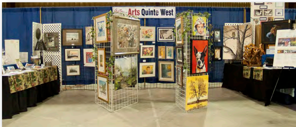
Arts Quinte West booth at the Quinte West Home & Leisure Show

2010 is off to a great start. Check page 2 for details about the rest of the events we have planned for the year. Come out and join us!