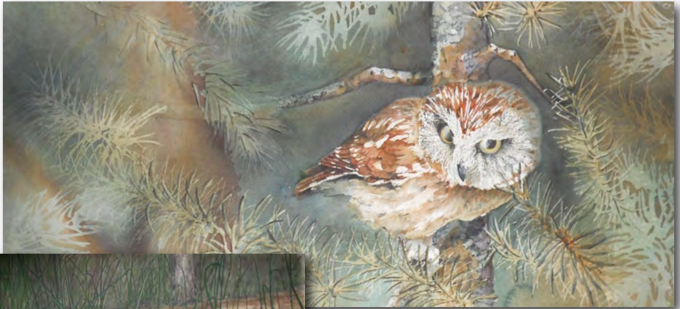
Above: Eye Catching by Rose Brown Original watercolour of Saw Whet Owl, 32" x 21.5"