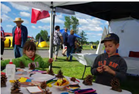
Canada Day - July 1: What a great day. The children showed again what creative spirits

Spring Studio Tour - June 12 - 13: The weather was not kind for the first day's showing but picked up on the Sunday. Some sites had better attendance than others and there were a few sales. A survey was sent to all participants and based on the replies we need to make some changes for next year.