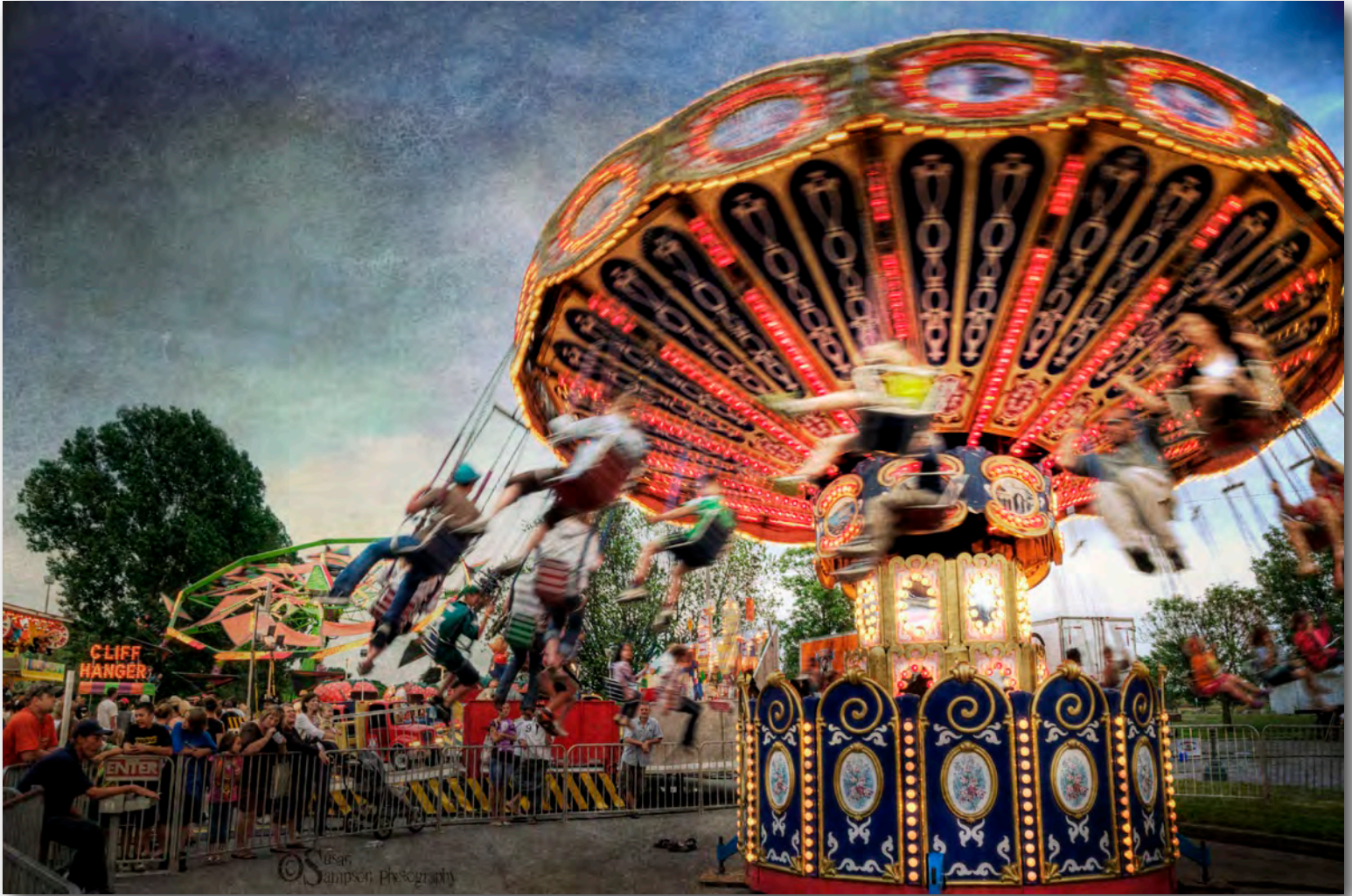
Go Round by Susan Sampson High Dynamic Range photographic print